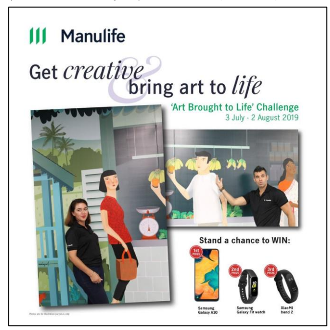
Photo caption: Manulife Malaysia Launches 'Bring Art to Life' Challenge. Follow Manulife Malaysia's social media pages in Facebook (/ManulifeMalaysia) or Instagram (@manulife.malaysia) for the complete steps and terms & conditions.

Follow Manulife Malaysia's social media pages in Facebook (/ManulifeMalaysia) or Instagram (@manulife.malaysia) for the complete steps and terms & conditions.